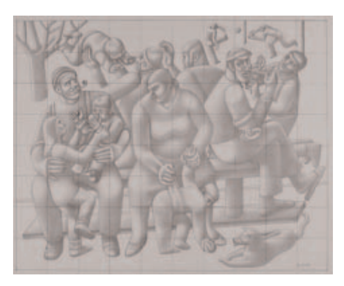
Pencil study for The Park Bench 1933