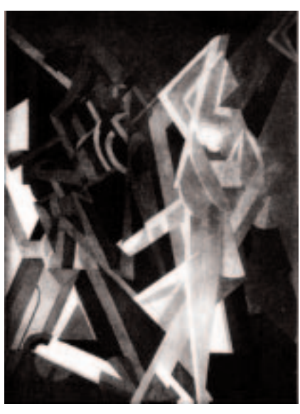
The Dancers – the oil as reproduced in Blast in June 1914