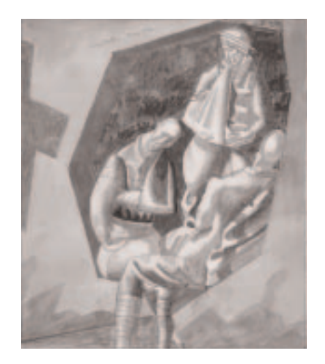
Red Cross Dressing Station, Advanced Post 1918

WR's pencil study for The Park Bench 1933 (aka Group of People Sitting on a Bench ) – see page 2 – will be included in