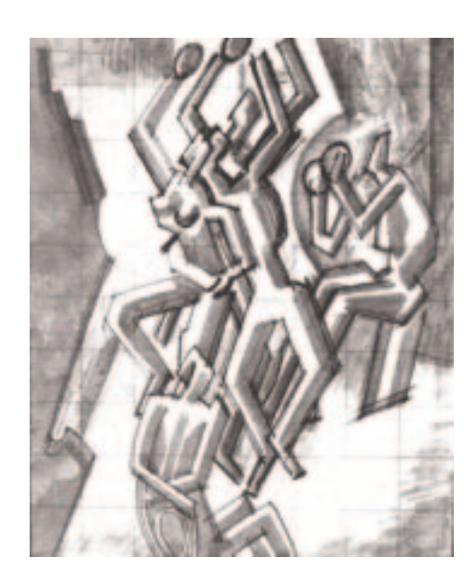
Dance with Tambourines 1918

shuffling rather claustrophobically around the dance floor.